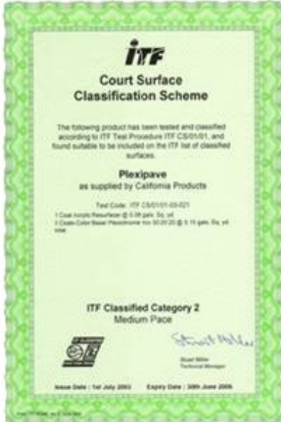
ITF (International Tennis Federation) Court Surface Classification for Plexipave

The Plexipave Colour Finish System is an